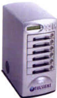
SW 700 (Tower)